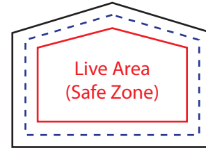
IPatch-House: 1.3" x 0.90"

Trim- Size of the actual page. - - - - -